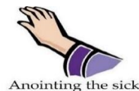
Anointing the sick

Arrangements must be made at least 1 year in advance. Preparations include sessions with a member of the clergy and attendance at a Pre-Cana Conference. For more information, please call the Parish Office.